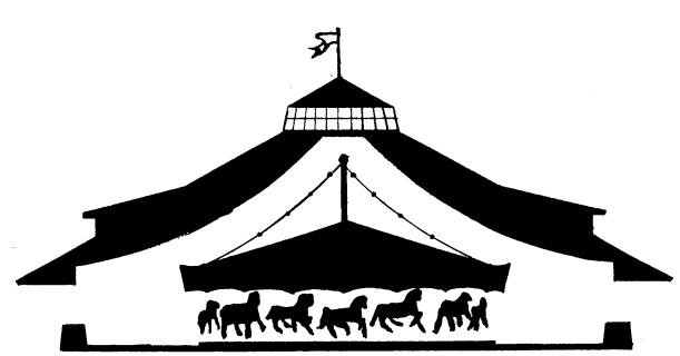
THE BEAR MOUNTAIN MERRY-GO-ROUND

Groups visiting Bear Mtn. are able to reserve the Bear Mountain Merry-Go-Round.